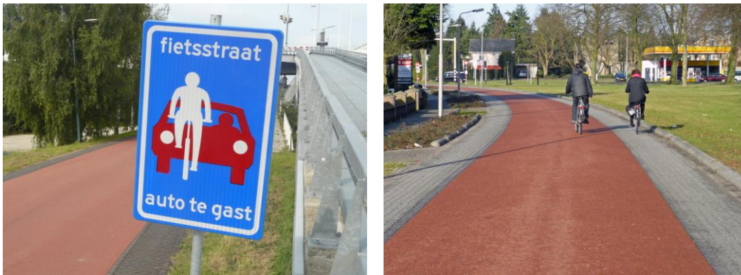
A sign for bicycle streets: BICYCLE STREET - HERE A CAR IS A GUEST

Promoting the electric bike will be part of the promoting and communication plan. One of the products will be a regional (electric) bike map.