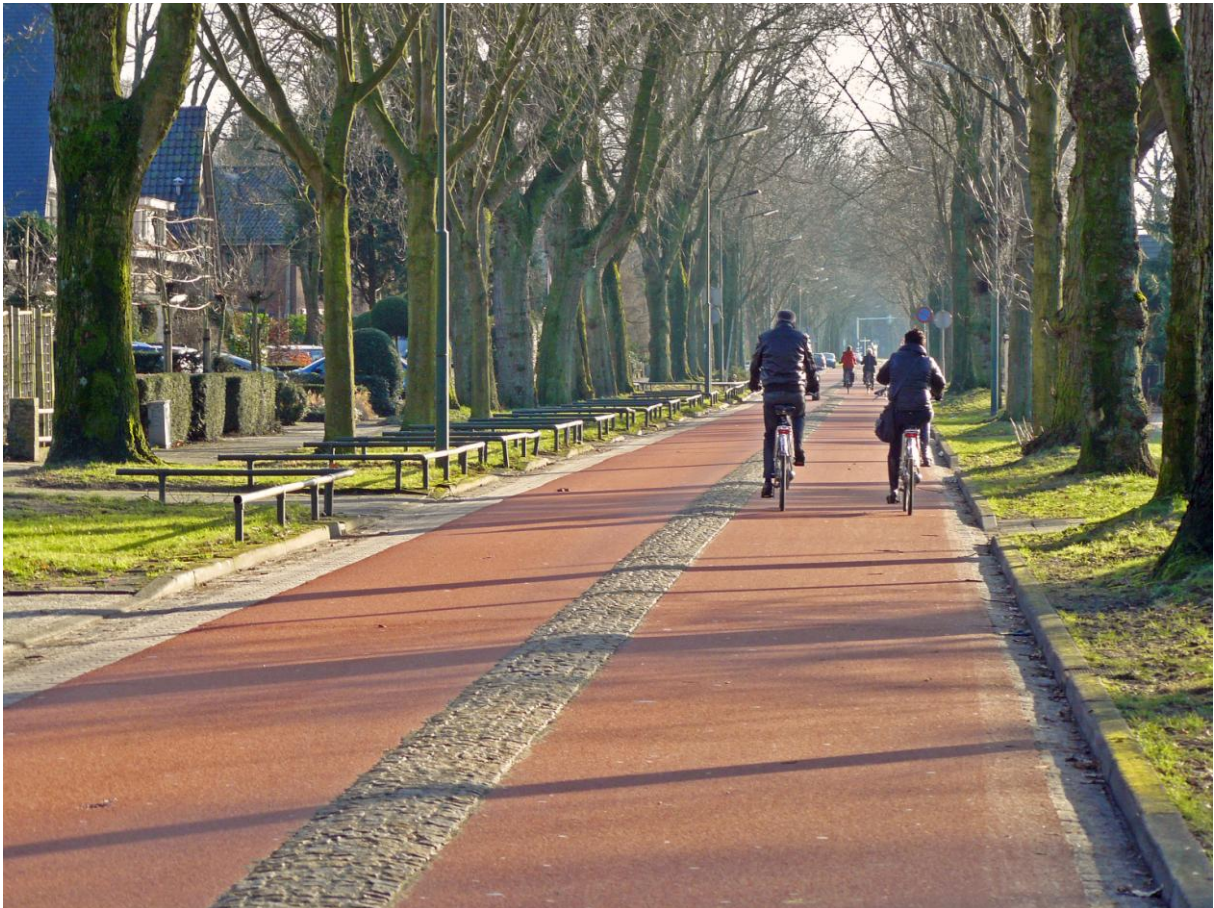
A bicycle street in the south of The Netherlands

Author: Ruud Ditewig municipality of Utrecht