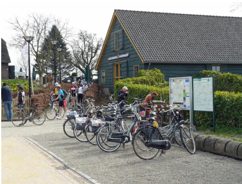
A typical scene at a bicycle point: a restaurant, bicycle parking, networkmaps and touristic information and facilities for power supply for electric bicycles