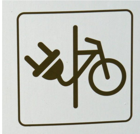
The bicycle stops are well signed. Note the pic for power supply