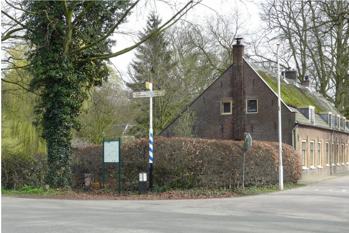
A junction in the regional bicycle network with signs and networkmap

Author: Ruud Ditewig municipality of Utrecht